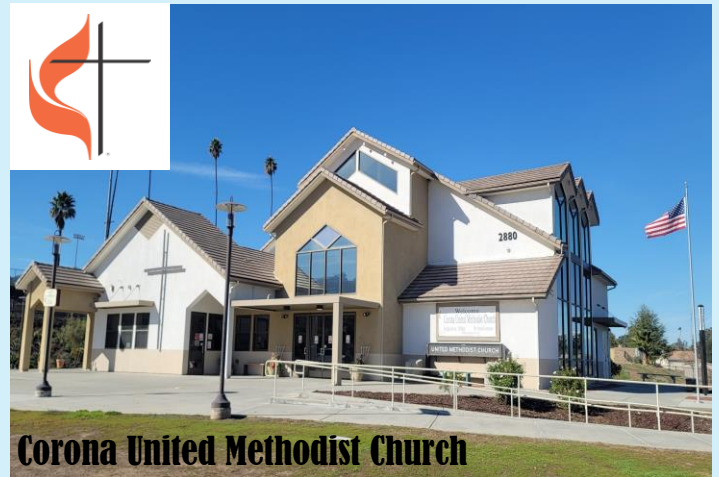
Corona United Methodist Church